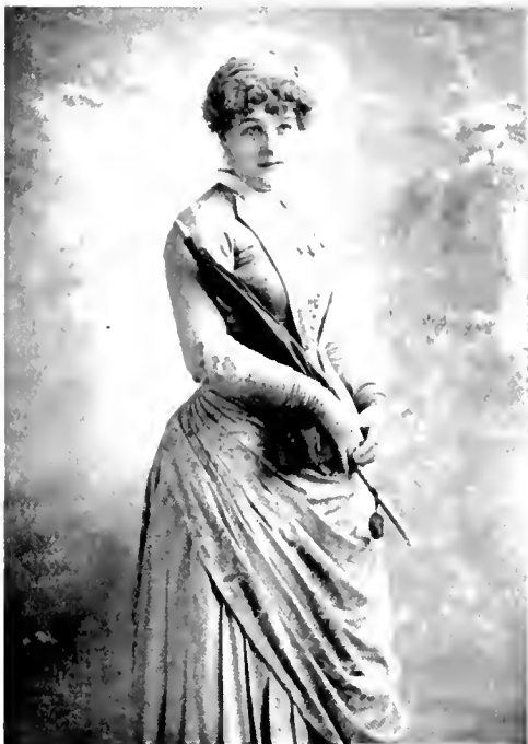
FANNY LILY GIPSY DAVENPORT